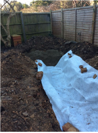
The back garden, and the swale taking shape.